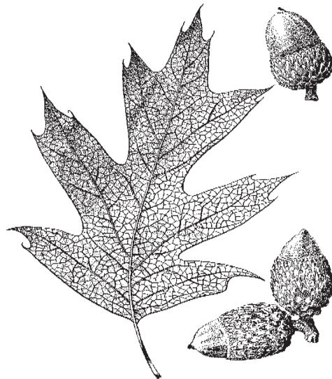
Black Oak Quercus kelloggii